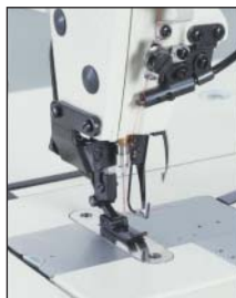
Needle thread clamp mechanism and sliding presser foot