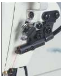
Needle thread draw-out mechanism

The machine comes with a silicon oil lubricating unit, thread spreading mechanism and thread trimming mechanism which trims the thread without fail, thereby consistently ensuring beautifully-finished seams for light- to medium-weight materials. The appearance of the machine is restyled, and it is now colored in a refreshing urban white.