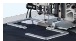
LK-1920 (Separately driven feeding frame <pneumatic>)