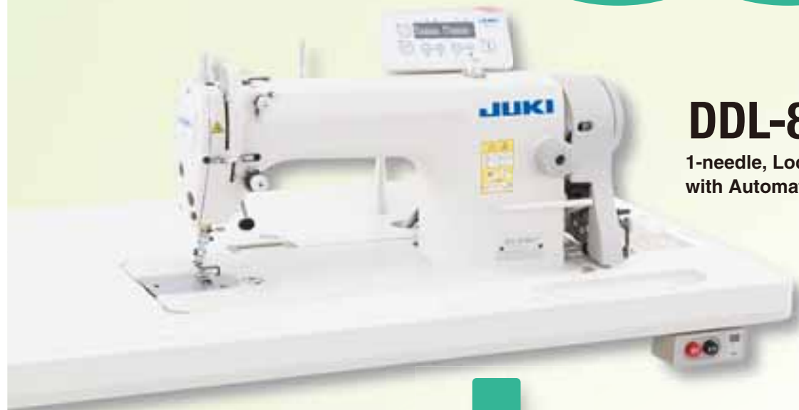
DDL-8700-7 1-needle, Lockstitch Machine with Automatic Thread Trimmer

The DDL-8700-7 is provided with the "new model control box" and the "new model compact servomotor," thereby substantially saving energy.