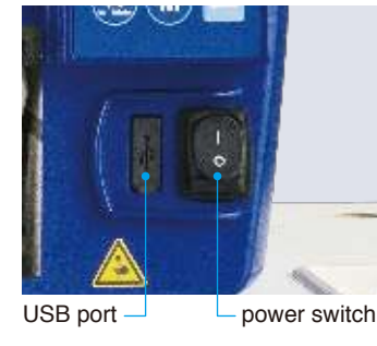
The power switch is built into the control box, making it easy to install the machine. Connection to the external output terminal is also very easy. The USB port is located below the control panel.

The operation panel is equipped box with ease with many different functions.