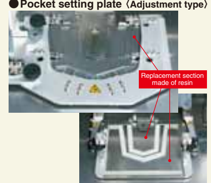
Pocket presser plate

● GARMENT PUT BASE ASM. [Part No. G90118750B0] This is the garment body rack (bar type) to be installed on the main body.