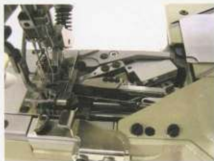
Usual Thread Trimmer